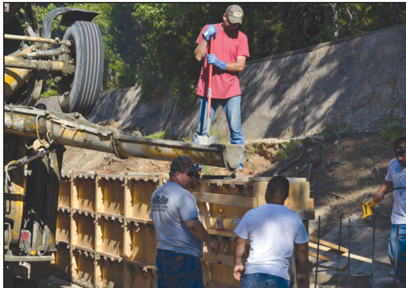
A new concrete wall behind the Bill H. Hill Library on Eastern's Wilburton campus kicked off a series of campus improvements now in the works.