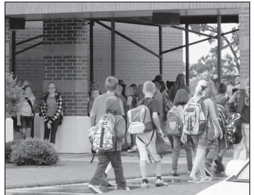
Fifth and sixth grade students of Parker Middle School walk to their classes that were being held on the McAlester campus of Eastern Oklahoma State College. The sixth grade students continue to use the McAlester campus.