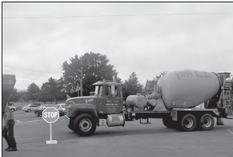
The crew moves in to start pouring concrete for the retaining wall behind the library.