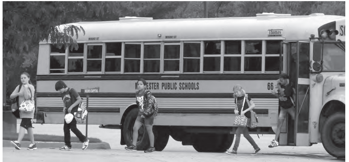
Parker Middle School students get off of a school bus at the McAlester campus.

Members of the Video Production class work to film the Mountaineer Minute. The Mountaineer Minute is a weekly broadcast of Eastern events, news, and happenings that is written, shot, and produced by students of the Mass Communication program.